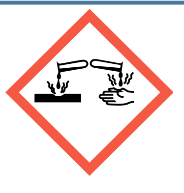
Signal Word: DANGER! - FOR HEALTH EFFECTS (Acute and Chronic): SEE SECTION 11